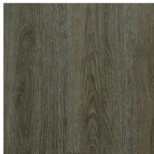
STONE OAK BROWN